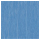
Heavy-Duty Light Blue