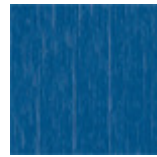
Heavy-Duty Royal Blue