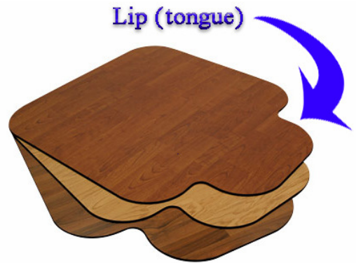
Cherry, Oak & Walnut

NOTE: All chair mats with a lip are listed using the overall size of the mat including the lip. Therefore, the rectangular "base" portion of the mat is smaller than the overall size listed.